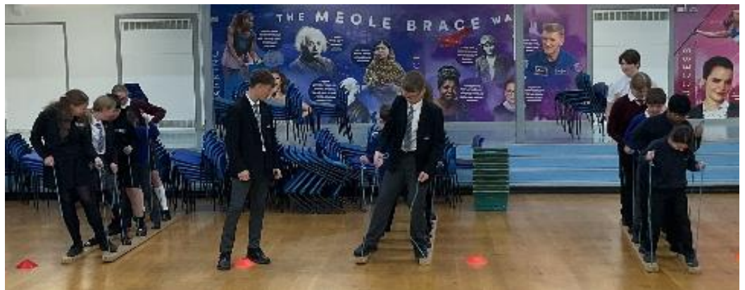
Pictured are members of TrustEd Parliament carrying out team building exercises.

Our students say that together, we can make a lasting impact!