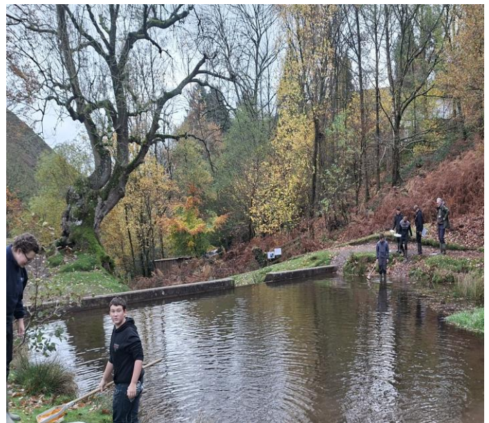
Pictured are students carrying out practical work