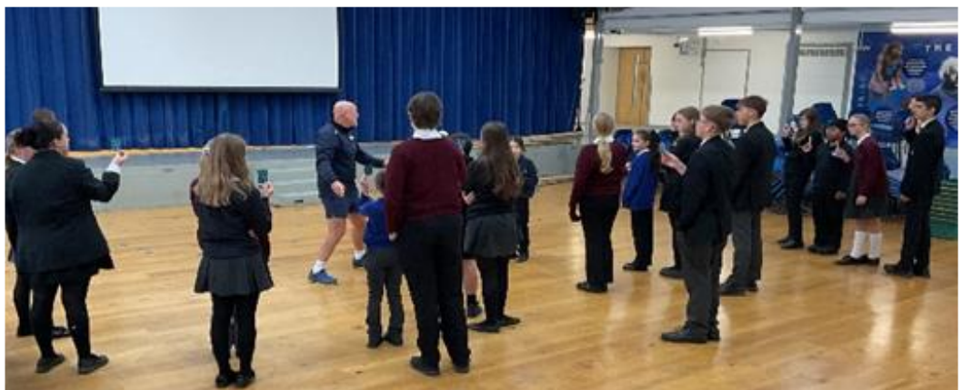
Mr Jew leading collaborative activities